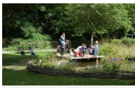
A pond dipping platform provides great opportunities to explore nature in a playful way (Kingfisher Barn Nature Reserve, Bournemouth)