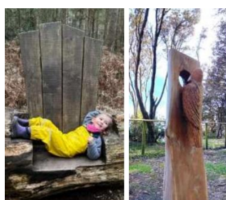
Story telling chair and a sculpture trail help children to connect with nature (Stanpit Marsh Nature Reserve, Christchurch)