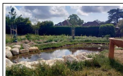
Wildlife garden at Kinson Recreation Ground